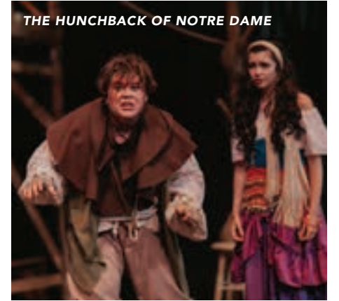
THE HUNCHBACK OF NOTRE DAME

Once we know what shows we're doing, we vote on who the director will be for each, as well as the music director, the choreographer, etc. Then, I'll meet with our set designer, choreographer, and music director to discuss themes and concepts.