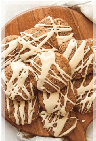
MAPLE-GLAZED apple cookies