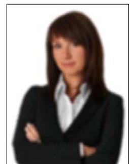
Image at 300 PPI