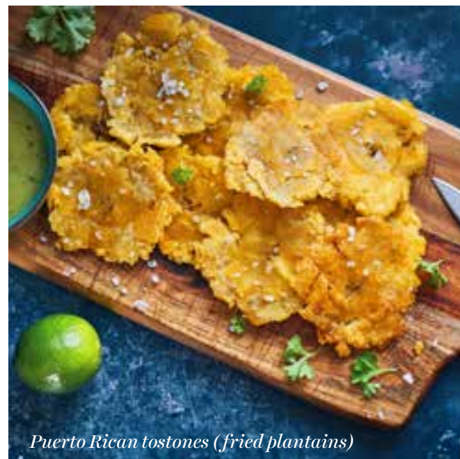
Puerto Rican tostones (fried plantains)

When the day breaks, continue living as the Boricuas, or local citizens, do at La Placita, a market where you can shop for fresh tropical produce and partake in the islands’ favorite dishes. Some classics unknown to many on the US mainland include arroz y habichuelas (a rice-and-bean