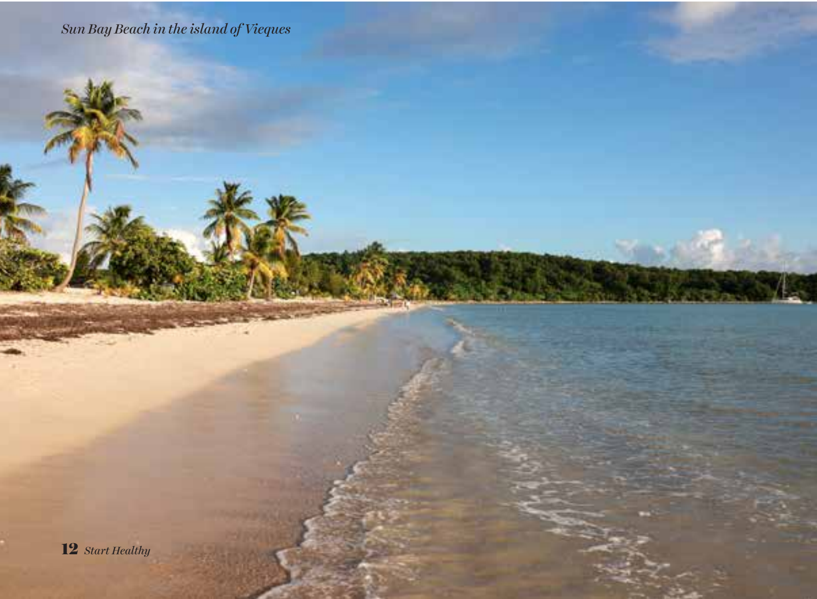
Sun Bay Beach in the island of Vieques

Rent a bike to ride along the shore, snorkel alongside intriguing Caribbean sea life (including four species of sea turtles), kayak around the island’s perimeter, take a fishing charter, or even book a sailboat that can take you as far as the US Virgin Islands to the east. However you decide to spend your day, be sure to linger after sunset to see a natural wonder at work—Vieques is home to the world’s brightest bioluminescent bay, where microorganisms produce natural light that makes the water glow.