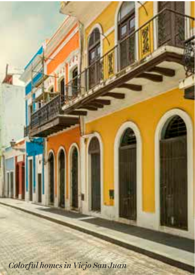
Colorful homes in Viejo San Juan

Just off the mansion’s prominent plaza is Calle de la Fortaleza, an art-and-eatery-lined promenade known for its multicolored structures. Embrace the freedom of getting lost in this district; there are dozens of other historic sites to encounter, from medieval cathedrals to structures designed to fend off pirates.