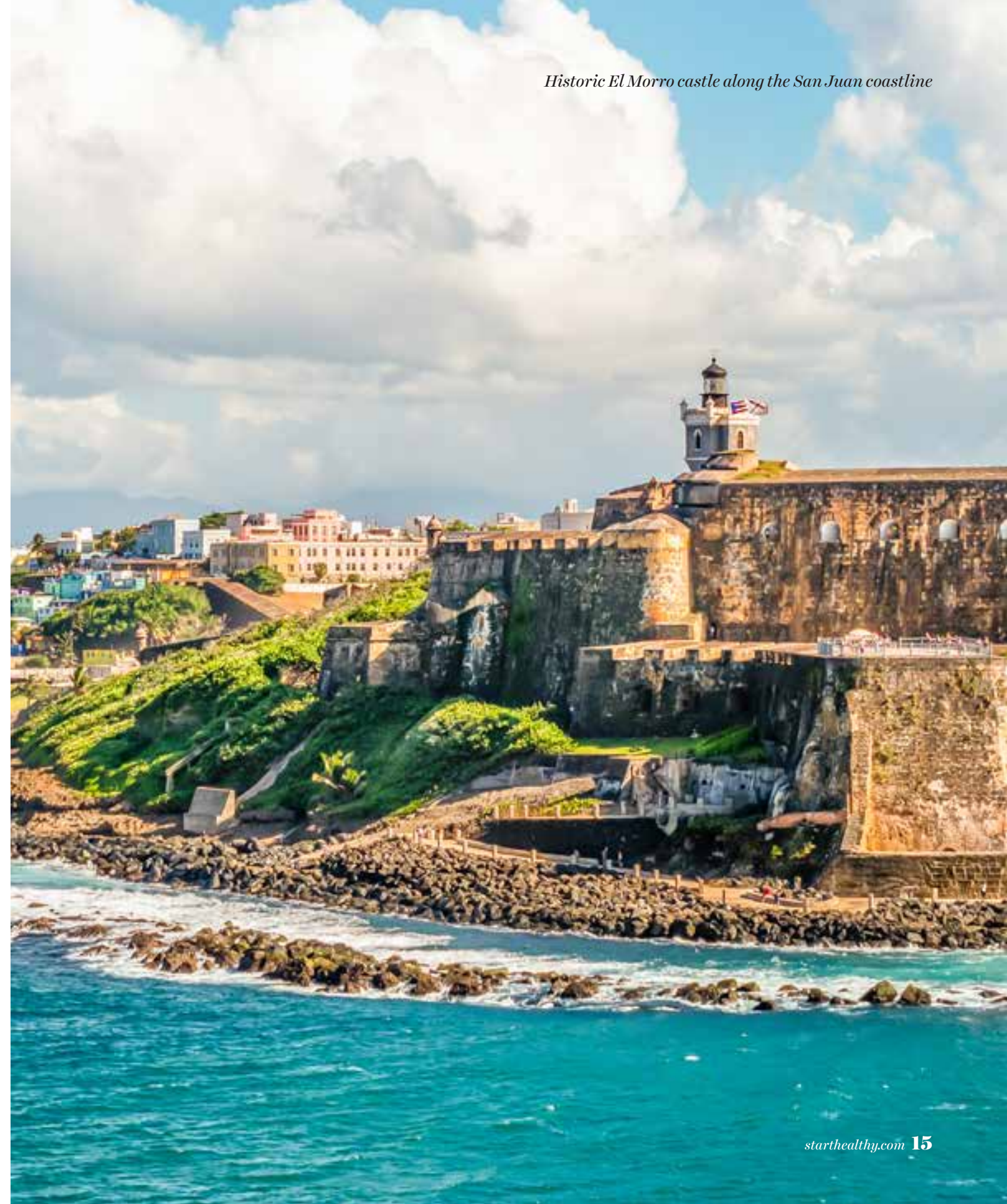
Historic El Morro castle along the San Juan coastline

For more info, visit discoverpuertorico.com