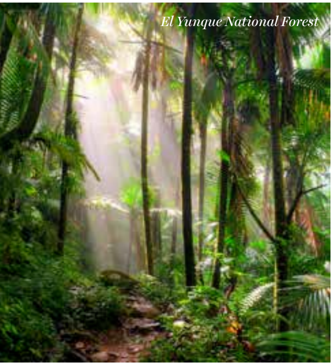
El Yunque National Forest

Set aside one morning for a hike in the United States’ only tropical rainforest, El Yunque. Sitting in the northeast portion of the mainland, this impossibly green paradise boasts mountain rivers that stream clear waters, an incredibly biodiverse landscape, and unique wildlife like the locally beloved coquí frog, which only lives in this forest. Prepare to get some exercise because El Yunque is best enjoyed either on foot or from the air via a hang glider. For a daring adrenaline rush, cliff-dive into one of the many natural pools throughout these lands. Just be sure to book your admission in advance on the USDA Forest Service website. To learn fascinating details about the delicate balance of wildlife and the efforts to conserve these lands, follow up your visit with a tour of the San Juan Botanical Garden.