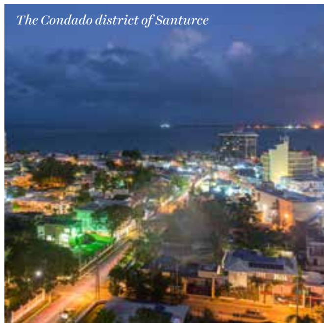
The Condado district of Santurce